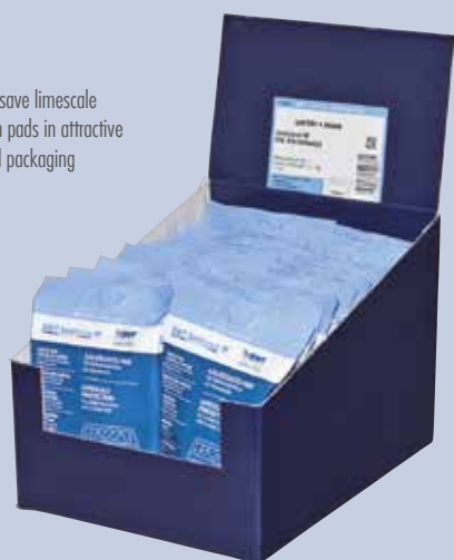
BWT bestsave limescale protection pads in attractive cardboard packaging

Removal of unwanted tastes and smells (e.g. chlorine)