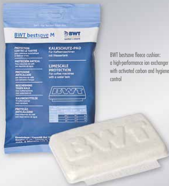
BWT bestsave fleece cushion: a high-performance ion exchanger with activated carbon and hygiene control